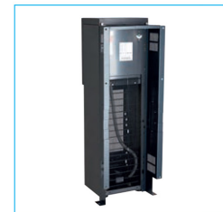
Cowling to fix the cooler securely to the wall. (Supplied separately). This also fits the AA3300X, Arctic Chill 88/98 & ArcticSpring 100C