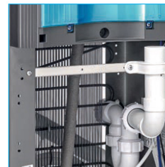
The drip tray can be connected to a 3ltr or 10ltr overflow tank or directly to the mains drainage. This can include a pump, to pump the waste up to 150m & 3m high