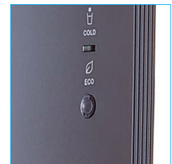
ECO sensor turns the boiler off when the office lights are switched off. Saves up to 33% in electricity