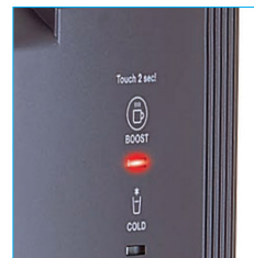
Hot water booster button to raise the temperature from 90°C to 95°C (Limited quantity)