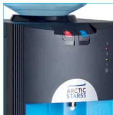
Modern, reliable, manual push down taps. Tamper & break resistant. Hot tap with safety lock

Modern design, sturdy & reliable. Hot & cold cooler has a hot water booster button & ECO light sensor to save up to 33% in electricity. The ArcticStar 55 can be fitted with SIPNeo3 automatic sanitising which can reduce sanitising frequency by 50%