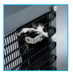
FloodGuard - inlet solenoid only opens to allow water into the cooler, when water is dispensed. By remaining closed all other times it protects the cooler against leaks. (On POU coolers only)

Sparkling water "on tap" rather than expensive bottled water. Available as a bottled or POU cooler. The AA 4400FZ2 can be fitted with SIPNeo3 automatic sanitising which can reduce sanitising frequency by 50%